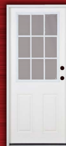
9 Lite 36" Door