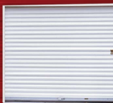
9' Roll-up Garage Door