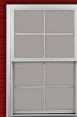
2' x 3' Window