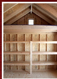
Example of Shelving