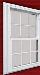
3' x 3' Thermal Window