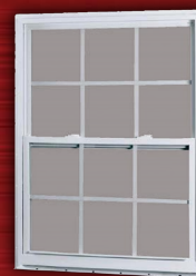
3' x 3' Window