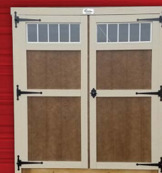
Transom Windows added to Wooden Doors